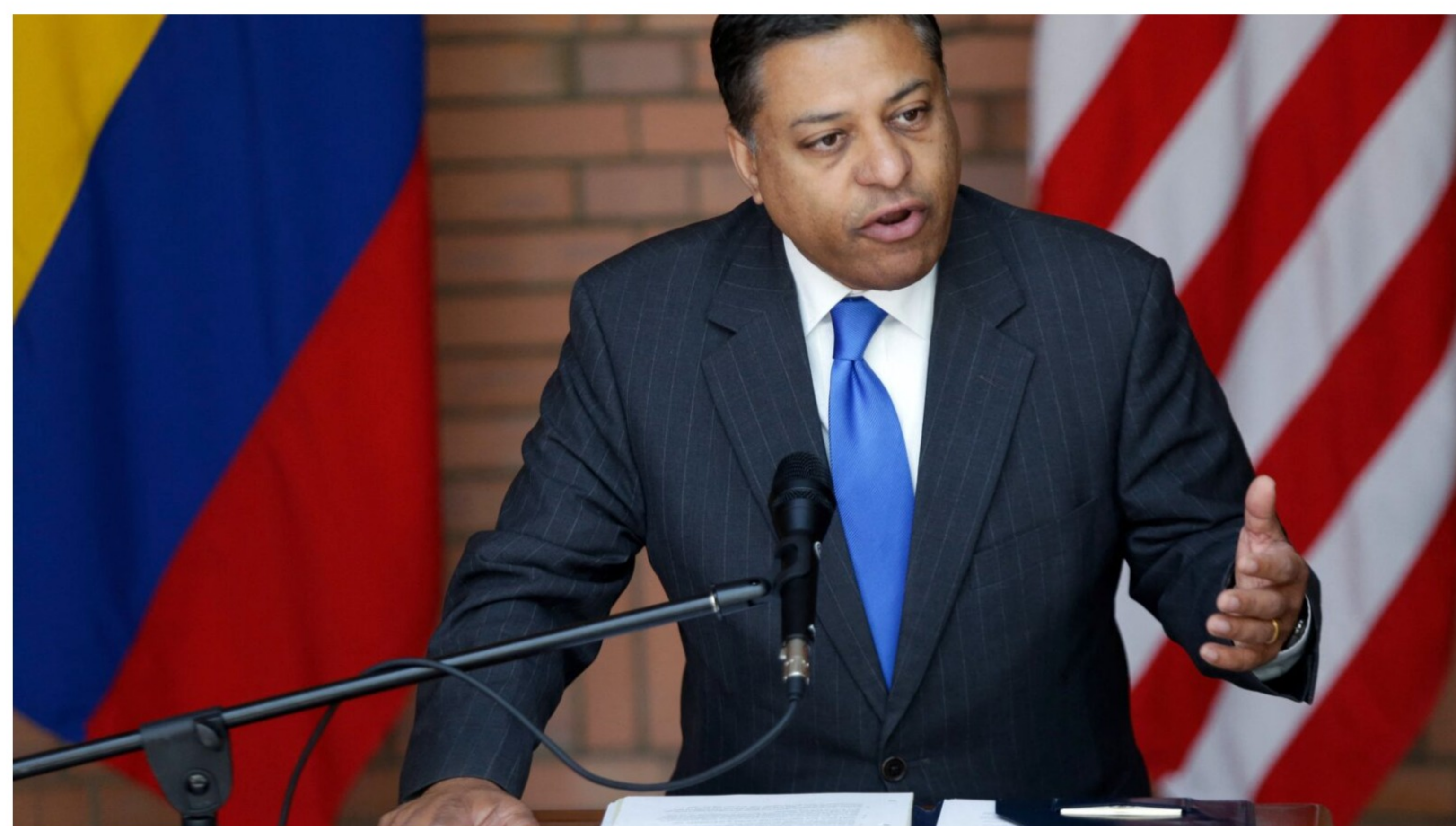
Rahul Gupta, director of the U.S. Office of National Drug Control Policy

WASHINGTON — At a House oversight hearing Thursday, the Biden administration's top drug policy official emphasized the need to address both mental illness and drug addiction simultaneously to reduce fentanyl deaths.